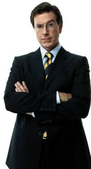
Market Fundamentalism ≈ Truthiness

We must dismiss Market Fundamentalism as an “oh my god what were we thinking” part of history, and replace it with ideas and policies that judge the health of the economy by the only measure that makes sense in a civilized society — how are the people doing?